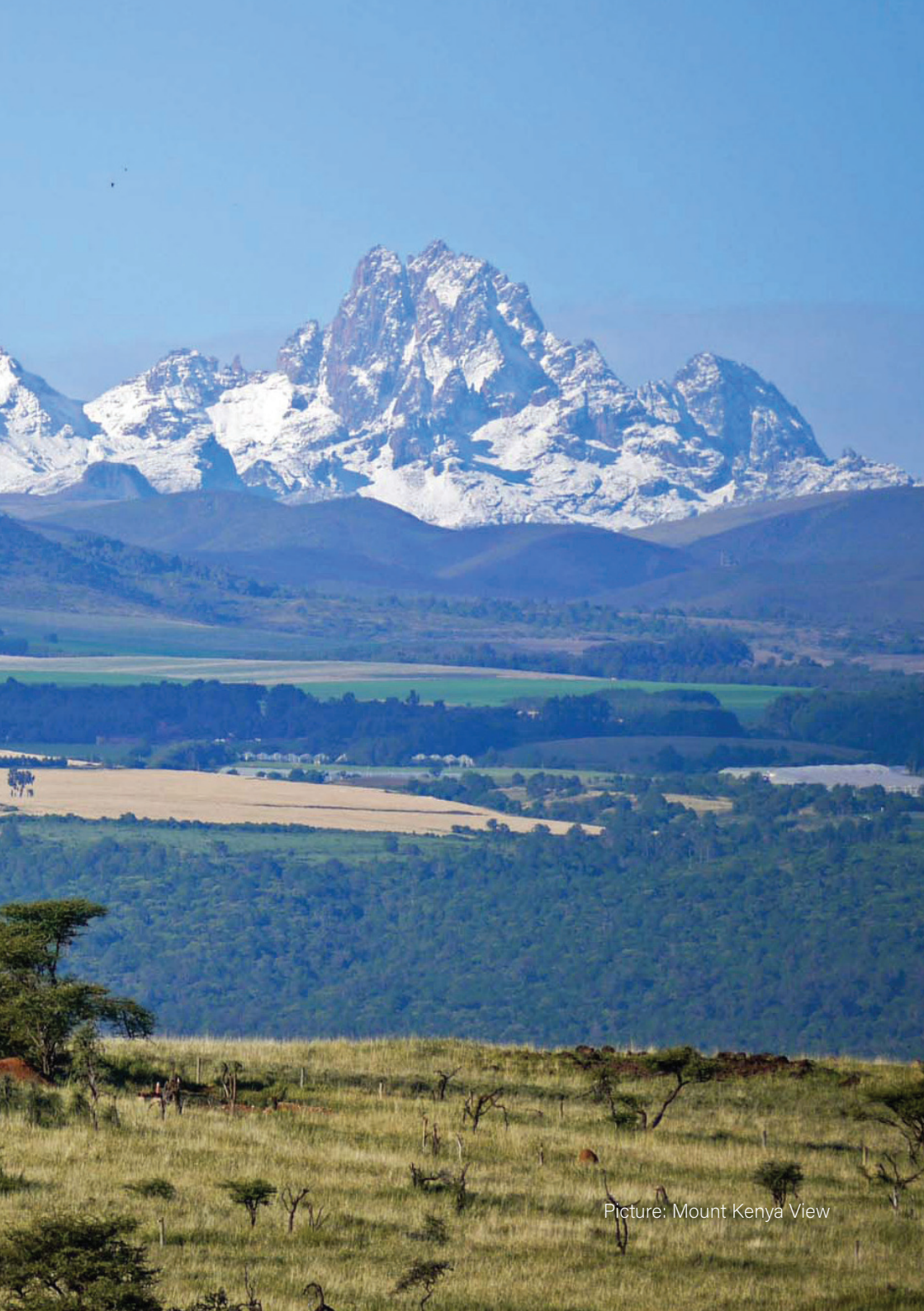
Picture: Mount Kenya View